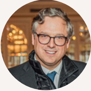
Chair of the Major Donors' Circle