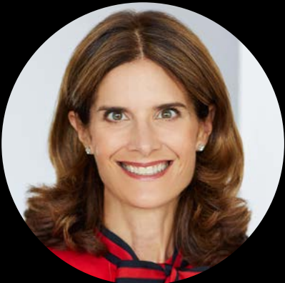
Honorary Chair of the Major Donors' Circle

President and Chief Executive Officer, Metro inc.