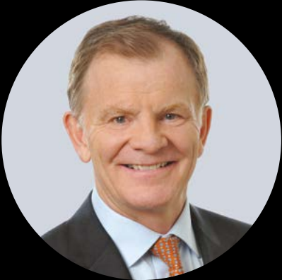
Chair of the Major Donors' Circle