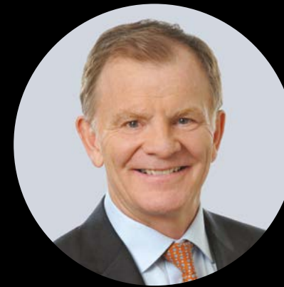
Chair of the Major Donors' Circle