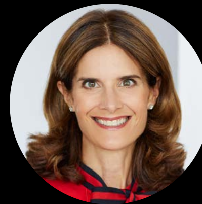
Honorary Chair of the Major Donors' Circle

President and Chief Executive Officer, Metro inc.